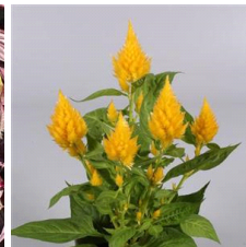
New Floriosa Yellow