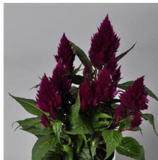
New Floriosa Purple