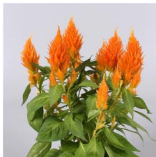
New Floriosa Orange