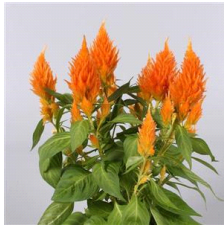
New Floriosa Orange