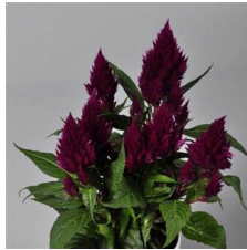
New Floriosa Purple