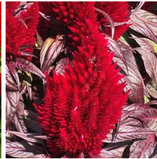
New Floriosa Red Dark Leaf