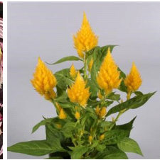
New Floriosa Yellow