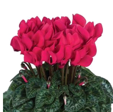
Dreamscape™ Deep Rose