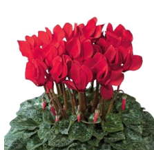
Dreamscape™ Bright Red