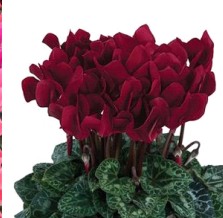
Dreamscape™ Deep Burgundy