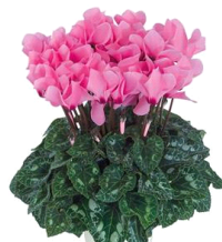
Dreamscape™ Rose Eye