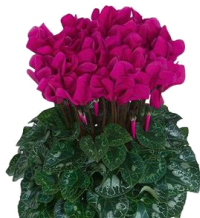
Dreamscape™ Bright Purple