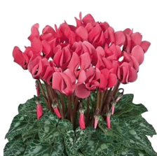
Dreamscape™ Salmon Eye