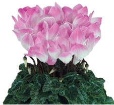
Indiaka® Light Rose