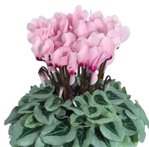
Metalis® Light Pink with Eye