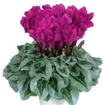
Metalis® Bright Purple